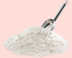
Flavor in powder matrix

We are looking for B2B2C distributors/food retailers to commercialize the first Organic Single-Origin Truffle Oils