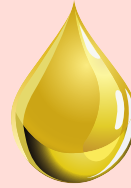
Flavor concentrate in oil matrix