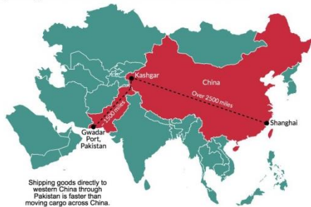
Strategic cargo route from Gwadar Port to western China

During the global financial crisis, Pakistan's economy has shown resilience and has maintained global and regional patterns and has performed better than some of the neighboring countries. International reports of repute have shown that Pakistan ranks ahead of regional countries.