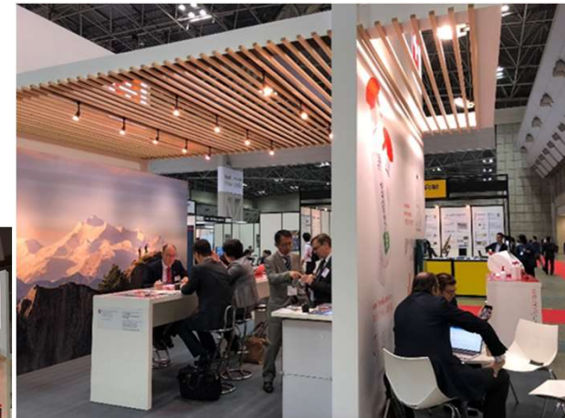
Impressions Medtec Japan 2018