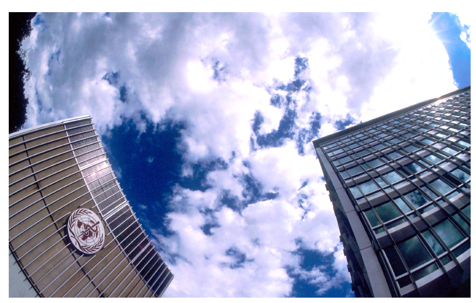
IMD World Talent Ranking 2020