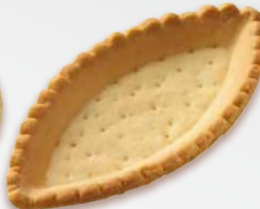
TN06* - Boat 105/50 mm