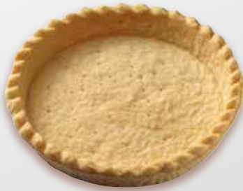
TS15 - Round 100 mm