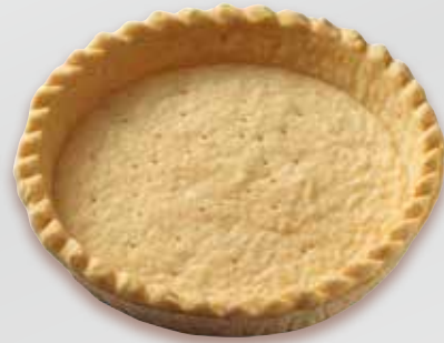
TS17 - Round 140 mm