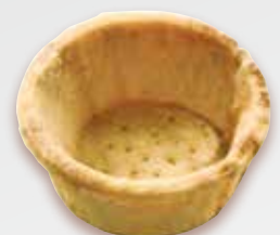
TS11mix - Mixed Sweet 42 mm