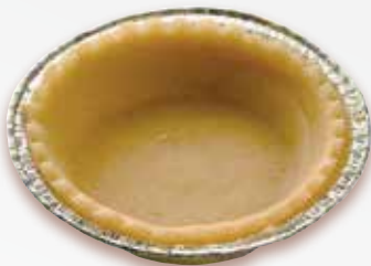
TN04ung - Round 69 mm