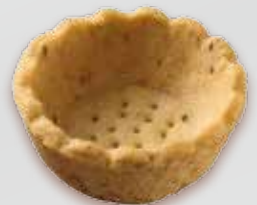
TS08 - Hazelnut Round 39 mm