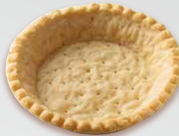
TN04* - Round 69 mm