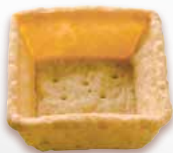
TN12* - Square 50 mm