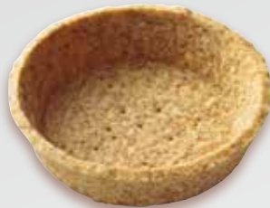
TS04voll* - Whole Wheat 69 mm (available in poppey seed and sesame)