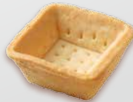
TS02* - Square 38 mm