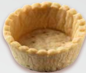
TN10* - Quiche 50 mm