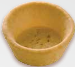
TN11 - Round Straight 42 mm