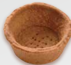
TS11cacao - Round Cacao 42 mm