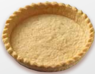
TS13* - Round 75 mm