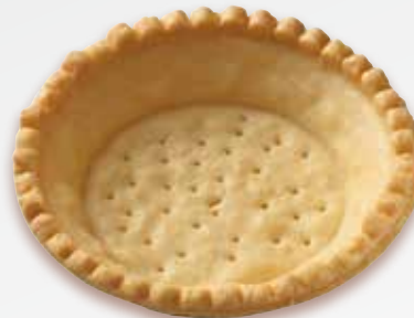
TS05* - Round 90 mm