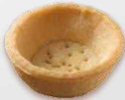
TS01* - Round 39 mm