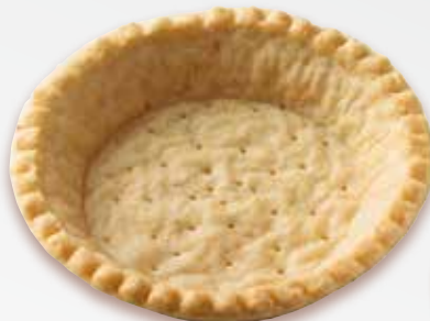
TN05* - Round 90 mm