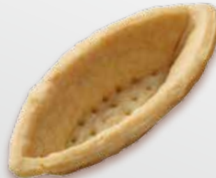
TN03* - Boat 63/26 mm