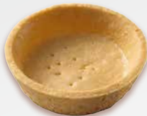
TS04* - Round 69 mm