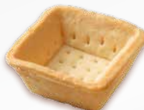
TS12* - Square 50 mm