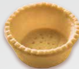
TS11 - Round Straight 42 mm