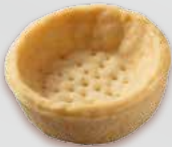
TN01* - Round 39 mm