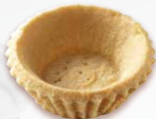
TS07* - Carac Round 63 mm