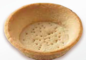
TS14* - Round Low 68 mm