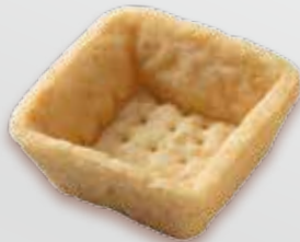
TN02* - Square 38 mm