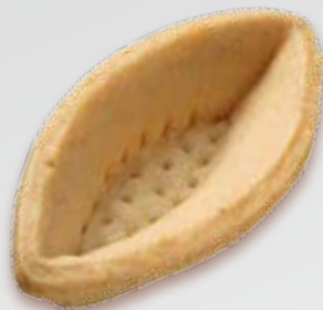
TS03* - Boat 63/26 mm