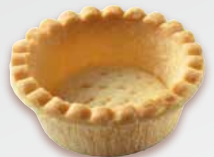
TS10* - Quiche 50 mm