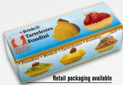
Retail packaging available