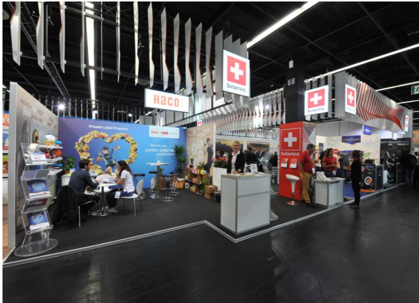
SWISS Pavilion, Anuga 2019, Köln