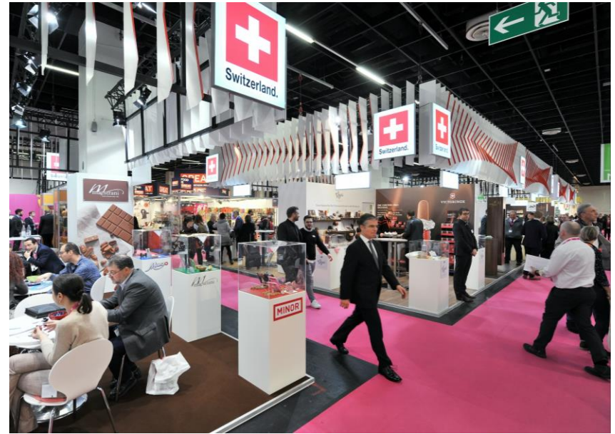
SWISS Pavilion, ISM 2019, Köln