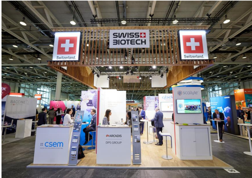
SWISS Biotech Pavilion @ BIO-Europe Spring 2023, Basel