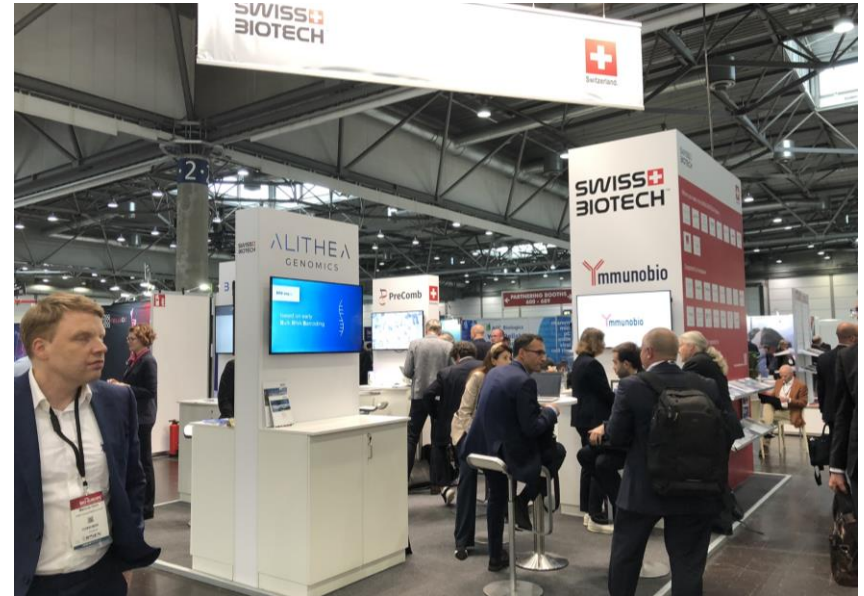
SWISS Biotech Pavilion @ BIO-Europe 2022, Leipzig