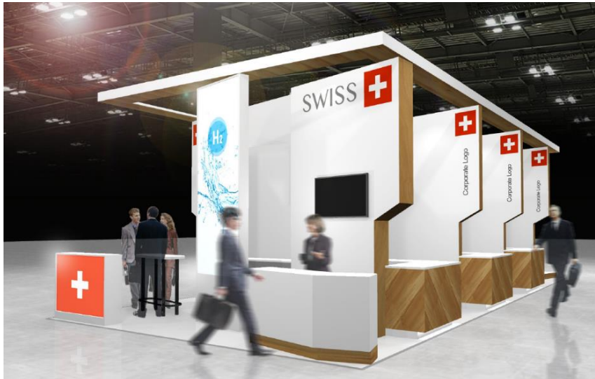
Image: Tentative design of SWISS Pavilion